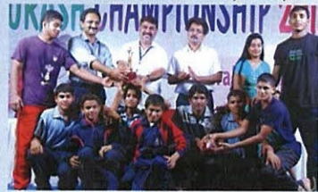
Karnataka secured runners up