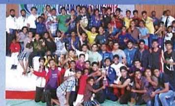
Kerala secured overall championship